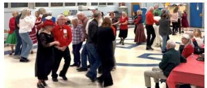
Holiday Potluck Dinner-Dance