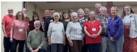
Students and angels